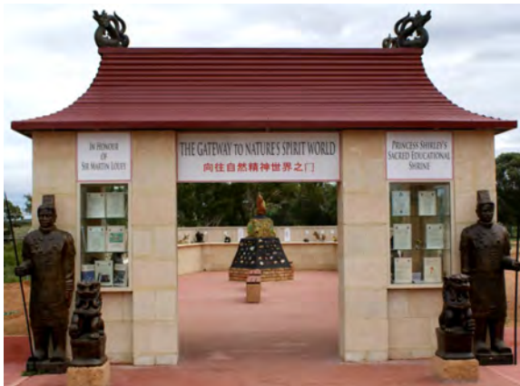
"Princess Shirley's Educational Shrine"

The town site of Nain has been developed with a number of buildings designed to provide facilities for the visitors who visit in their thousands each year. Facilities include: The Administration Building, containing Government Offices and the Royal Hutt River Post Office. The Chapel of Nain, a charming Inter-Denominational Chapel. The arcade which houses the Memorabilia Department and Historical Society displays. The Sovereigns Reception building and Princess Shirley's Sacred Educational Shrine, the Gateway to Natures Spirit World, which also houses the 'Stone of Light'.